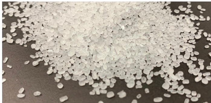
TRIS AMINO AC Advanced Crystals from Advancion