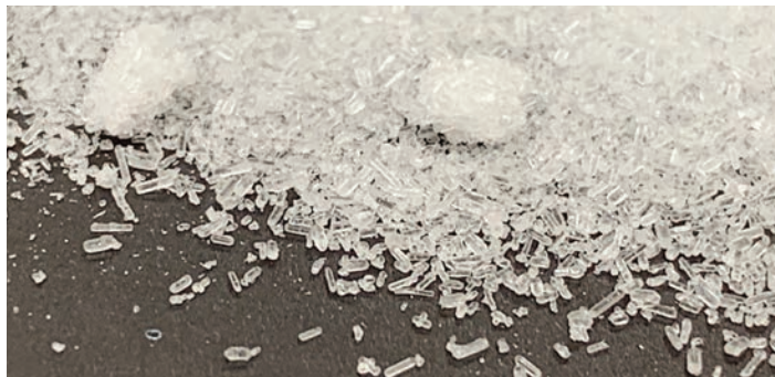
Conventional TRIS crystal structure

The unique morphology of TRIS AMINO AC buffers helps reduce cake strength, resulting in less clumping and hardness than competitive materials.