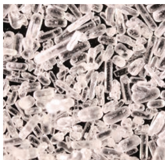
Conventional TRIS crystal structure